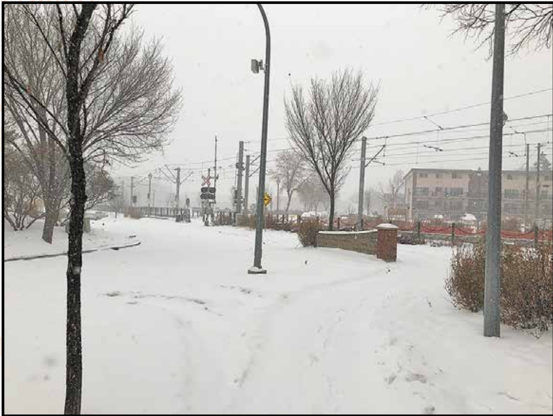
Nearby L.R.T. Station